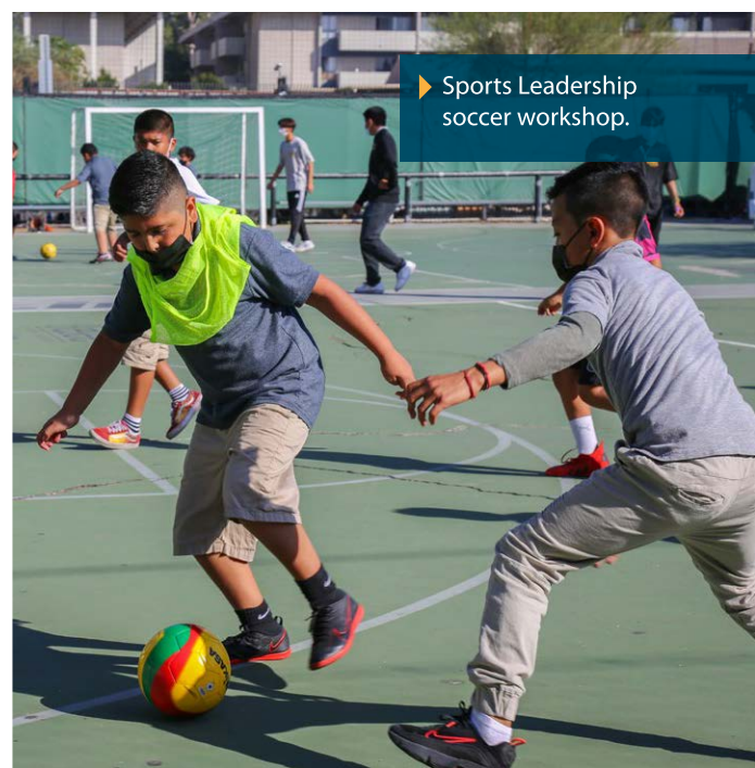
▶ Sports Leadership soccer workshop.