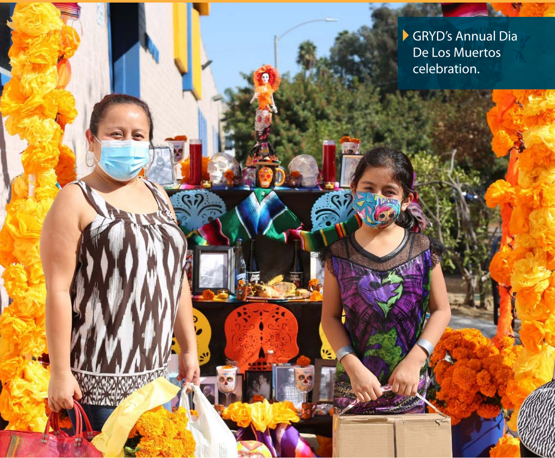
► GRYD's Annual Dia De Los Muertos celebration.