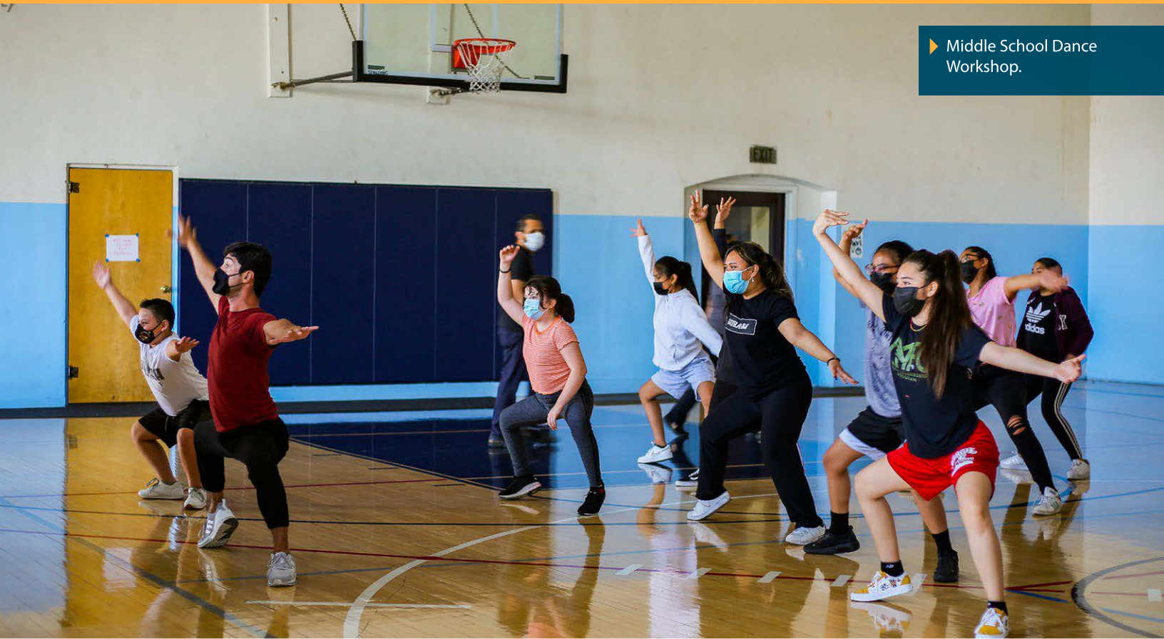
▶ Middle School Dance Workshop.