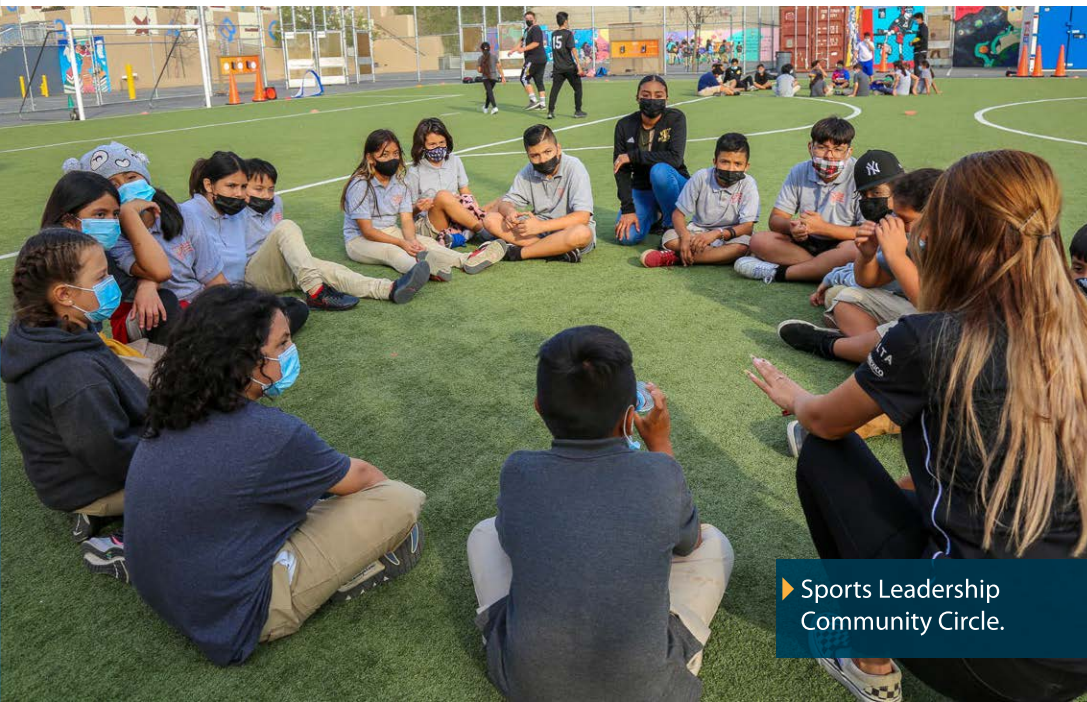
► Sports Leadership Community Circle.